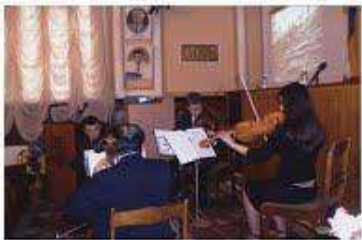
A concert for delegates of the conference.