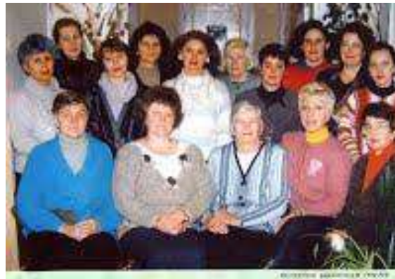
The collective body in 1998.

To support the employees of the library in those complicated nineties, up to 10 vacant rates of wages were used as additional charge to their payment.